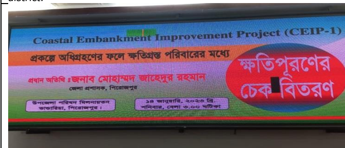
Photo 11: Mr. DC, Pirojpur distributed cheque to awardees of Polder-39/2C on 14.01.2023.