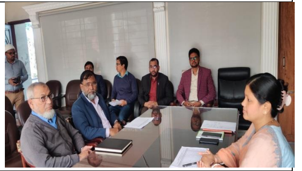
Photo 8: Meeting with UNO, Bhandaria Upazila under Pirojpur district regarding alignment problems of Polder-39/2C.