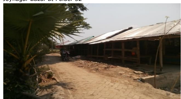
Photo 35: Market Relocation for Anando Bazar, Razapur at Polder 35/1