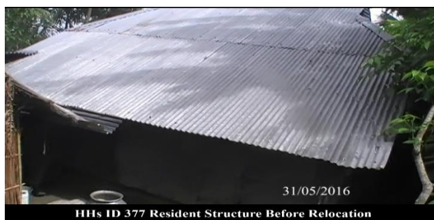
HHs ID 377 Resident Structure Before Relocation