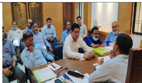
Photo 2: Meeting with ADC & LAO, Pirojpur in presence of PD, CEIP-1 regarding to expedite the CUL payment of Polder-39/2C.