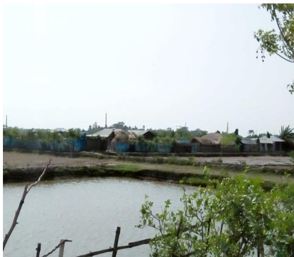
Photo 29: Group Relocation site: Meeting at CEIP Village, Uttar Kamarkhola under Polder-32