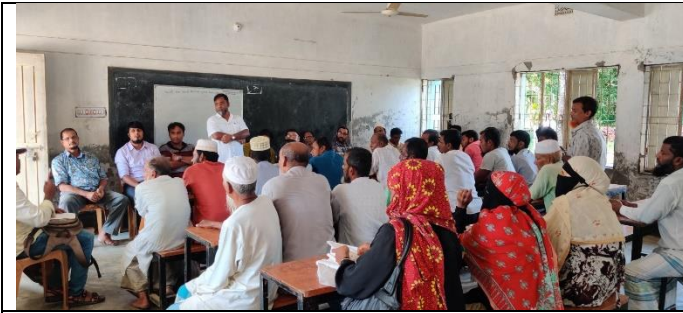
Photo 3: Meeting with awardees at Choto-Shewla mouza of Polder-39/2C for submission of application to get CUL payment.