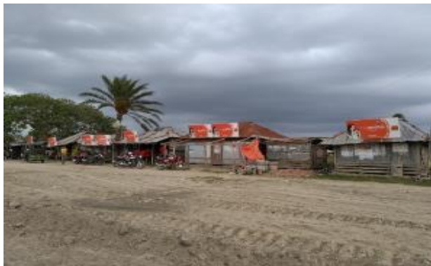
Photo 33: Relocation site at Mollikerber Madrasha Bazar in Polder-35/3

Business owners are encouraged for relocating their business concerns in a cluster market at the locations nearby of the affected market. The following photographs show the new market locations.