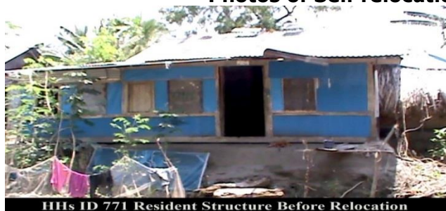
HHs ID 771 Resident Structure Before Relocation