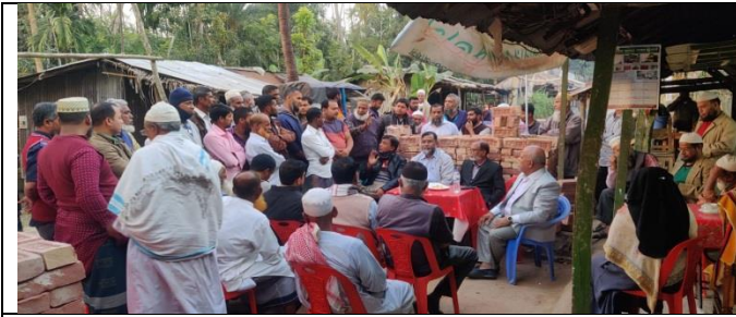
Photo 13: Meeting with UNO, Bhandaria of Pirojpur District at Monju bazar regarding alignment issues of Polder-39/2C