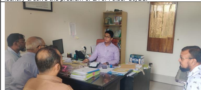
Photo 19: The LA Committee is requests the LAO of Pirojpur to expedite the payments for the acquired land of Polder-39/2C.