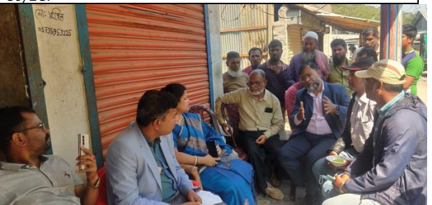
Photo 10: Meeting with UNO, Bhandaria of Pirojpur District at Monju bazar regarding alignment issues of Polder-39/2C