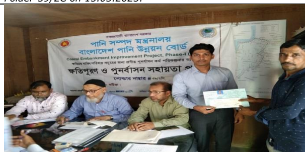
Photo 26: Compensation & Resettlement Assistance provided to squatter in Polder-39/2C through BWDB.