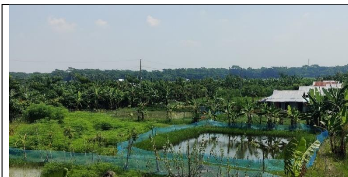
Photo 36: Group relocation site of Dhakin Charduani of Polder 40/2