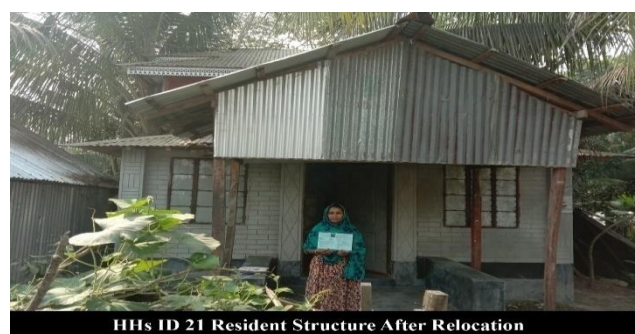
HHs ID 21 Resident Structure After Relocation