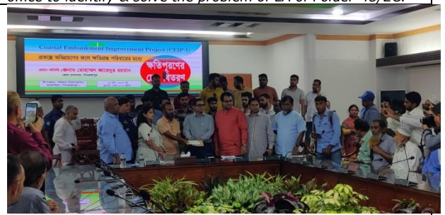
Photo 20: Mr. DC, Pirojpur distributed cheque to awardees of Polder-39/2C on 15.03.2023.