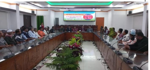
Photo 12: Mr. DC, Pirojpur distributed cheque to awardees of Polder-39/2C on 14.01.2023.