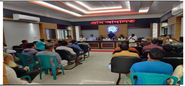
Photo 14: Meeting with Chairman of Telekhali UP regarding shifting the illegal structures from the alignment of Embankment of Polder-39/2C