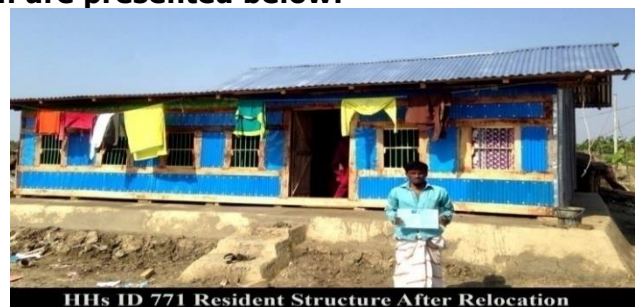
HHs ID 771 Resident Structure After Relocation