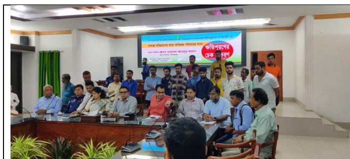
Photo 23: Mr. DC, Pirojpur distributed cheque to awardees of Polder-39/2C on 15.03.2023.