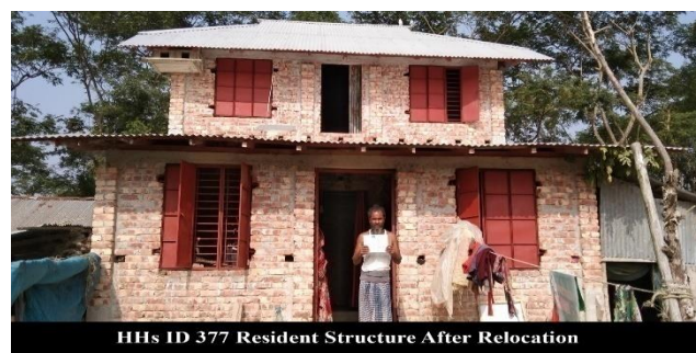
HHs ID 377 Resident Structure After Relocation