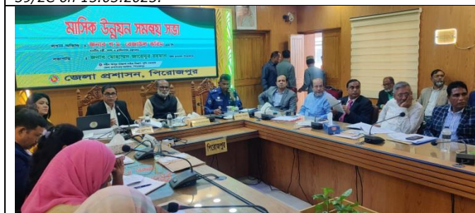
Photo 25: Presence of representative of CEIP-1 project in Monthly Development Meeting of Pirojpur DC office.