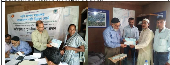
Photo 27: Compensation & Resettlement Assistance provided to squatter in Polder-39/2C through BWDB.