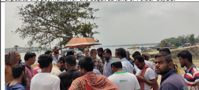
Photo 21: The LA committee created a working environment by meeting with those who had problems to embankment work from km 19.100 to 20.000 of P older-43/2C.