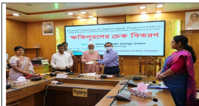
Photo 1: DC, Pirojpur distributed cheque to awardees of Polder-39/2C.