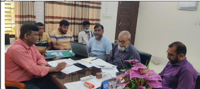
Photo 17: LA Committee meeting was held at Pirojpur XEN office to identify & solve the problem of LA of Polder-39/2C.