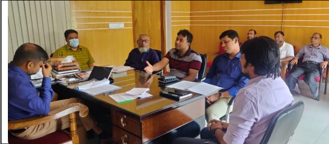
Photo 5: Meeting with ADC & LAO, Jhalakathi in presence of WB Team & PMU officials regarding to expedite the CUL payment of Polder-39/2C (Jhalakathi District).