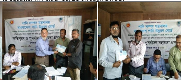
Photo 28: Compensation & Resettlement Assistance provided to squatter in Polder-39/2C through BWDB.