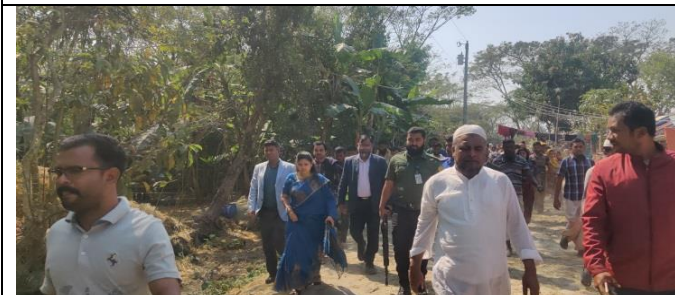
Photo 9: Field visited at alignment of embankment near Japani Barracks of Polder-39/2C with UNO, Bhandaria Upazila of Pirojpur district.