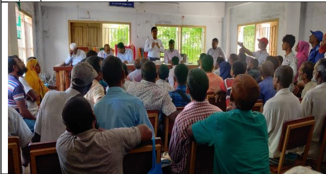
Photo 7: Consultation Meeting with titled landowner at Suterkhali UP of Polder-32 in presence of DC officials.