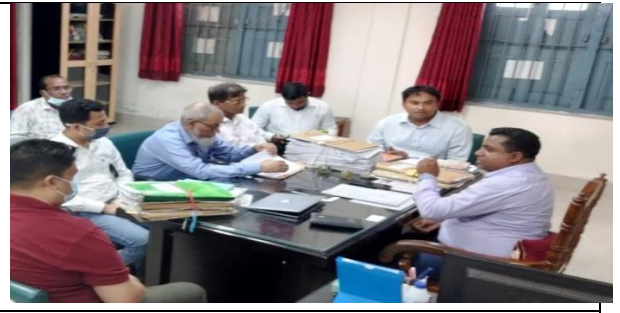
Photo 4: Meeting with ADC, Patuakhali regarding LA issues and payment of CUL of Polder-43/2C, 47/2 & 48.