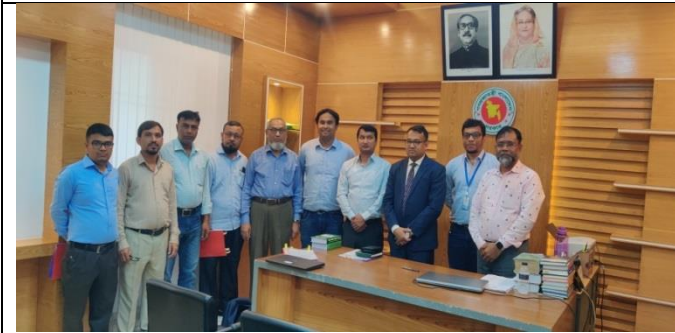
Photo 15: Meeting with ADC, Pirojpur regarding to expedite the CUL payment of Polder-39/2C.