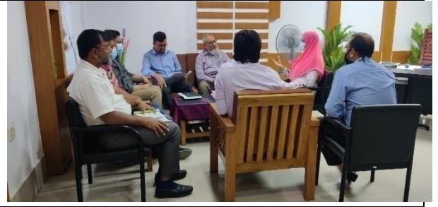
Photo 6: Meeting with ADC, Khulna in presence of WB & PMU officials regarding expedite the CUL payment of Polder-32 & 33.