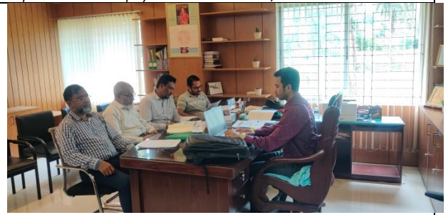
Photo 18: LA Committee meeting was held at Patuakhali XEN office to identify & solve the problem of LA of Polder-43/2C.