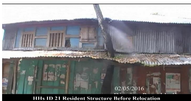
HHs ID 21 Resident Structure Before Relocation