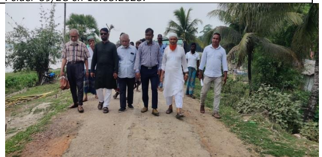
Photo 22: The LA committee along with the local UP Chairman, member & others requested the house owners to remove the structures for the embankment work of Polder-43/2C.