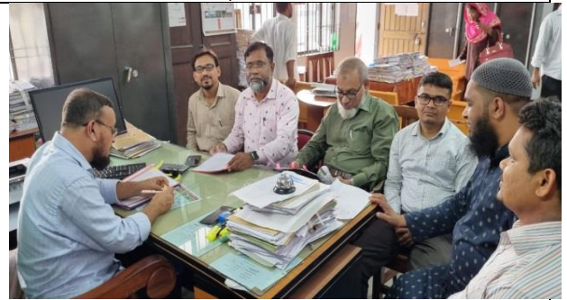
Photo 16: Meeting with LA branch of Pirojpur regarding to expedite the CUL payment of Polder-39/2C.